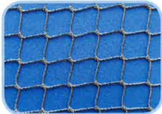
Stone color 3/4"