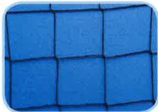
Black color 2"