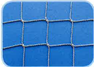
Stone color 1-1/8"