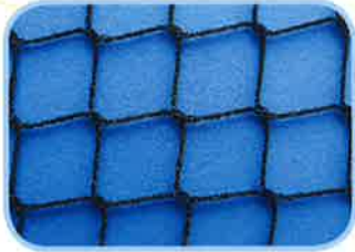
Black color 3/4"