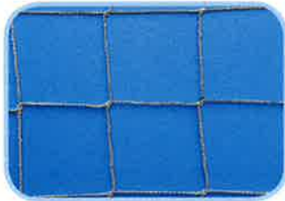
Stone color 2"