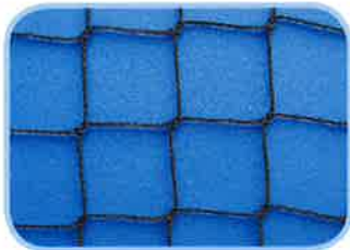
Black color 1-1/8"